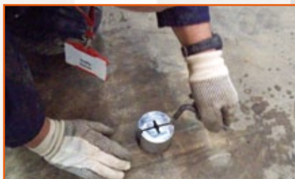
2. Insert the CoGri Joint Stabiliser.