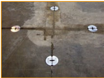
CoGri Joint Stabiliser installed.

Floor joints can be a problem in concrete floors and often the greatest source of maintenance problems in industrial or warehouse floors.