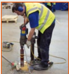
1. Drill the hole.

The CoGri Joint Stabiliser can be installed quickly by approved installers. Immediately after the device is locked in place, the floor can return to service.